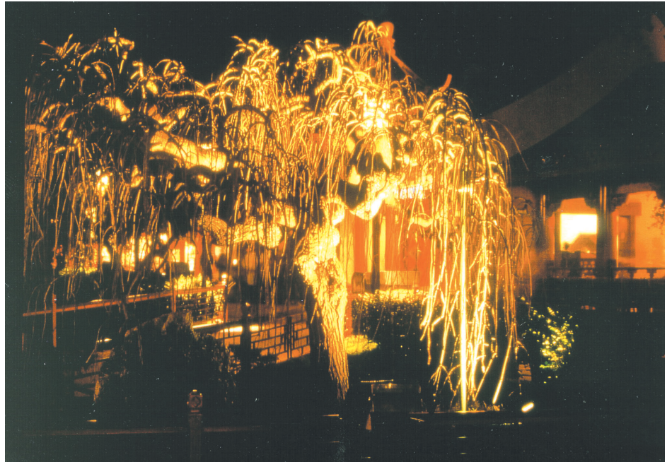
Highlighted Chaparral Mulberry at Disney World - Orlando, FL