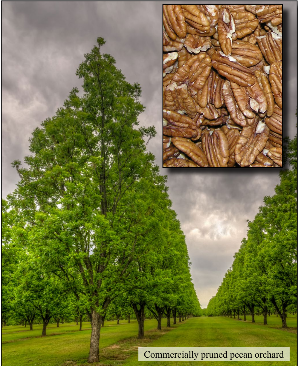
Commercially pruned pecan orchard