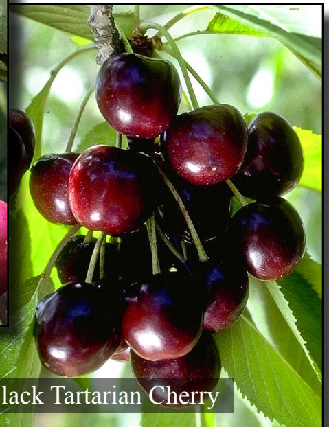
Black Tartarian Cherry