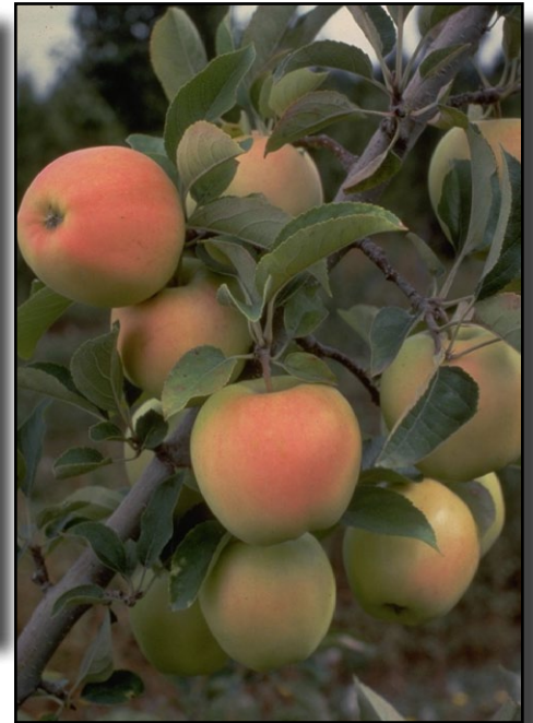
Dorsett Golden Apple July