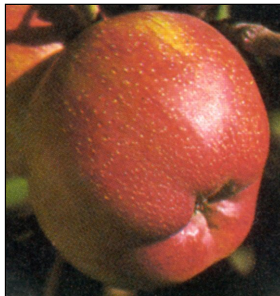
Gordon Apple August-September