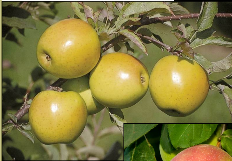
Ein Shemer Apple June