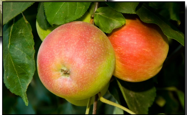
Early Summer Red Apple July