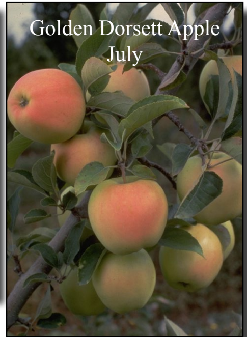
Golden Dorsett Apple July