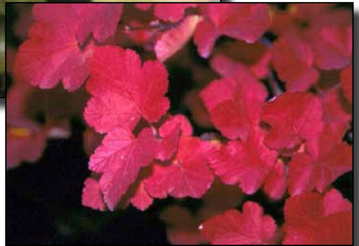
Fall foliage color