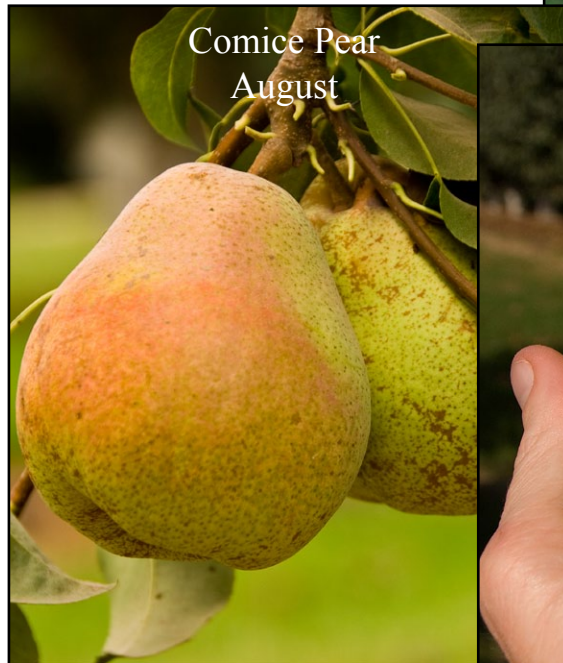
Comice Pear August