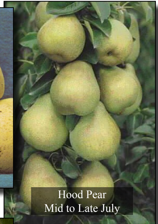
Hood Pear Mid to Late July