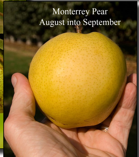
Monterrey Pear August into September