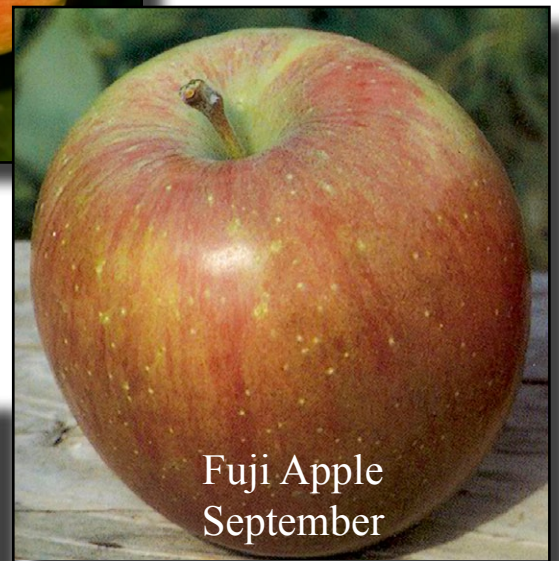
Fuji Apple September