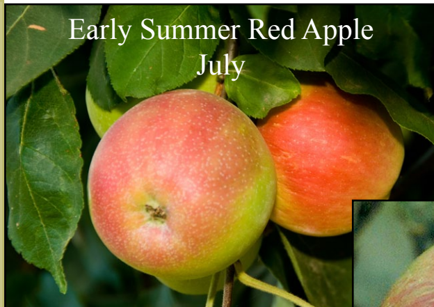
Early Summer Red Apple July