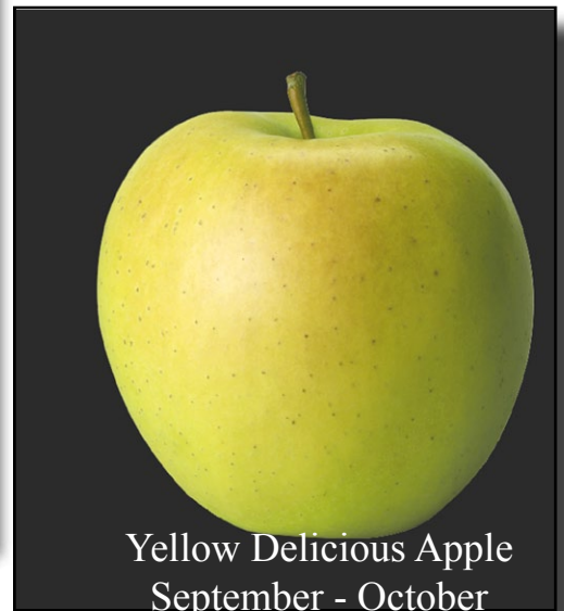
Yellow Delicious Apple September - October