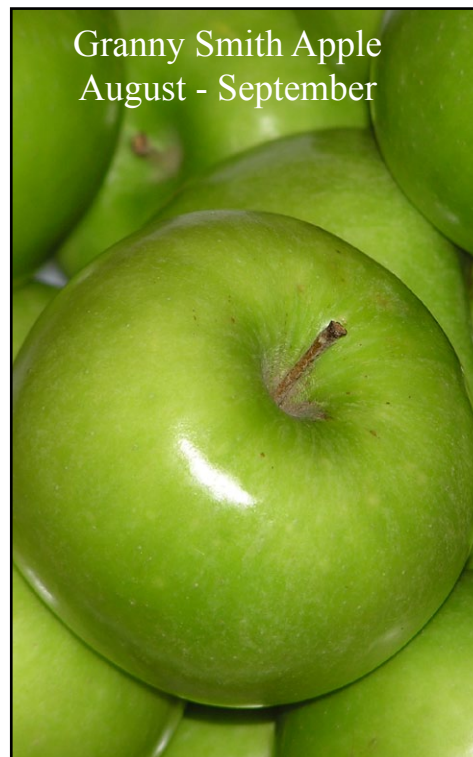
Granny Smith Apple August - September