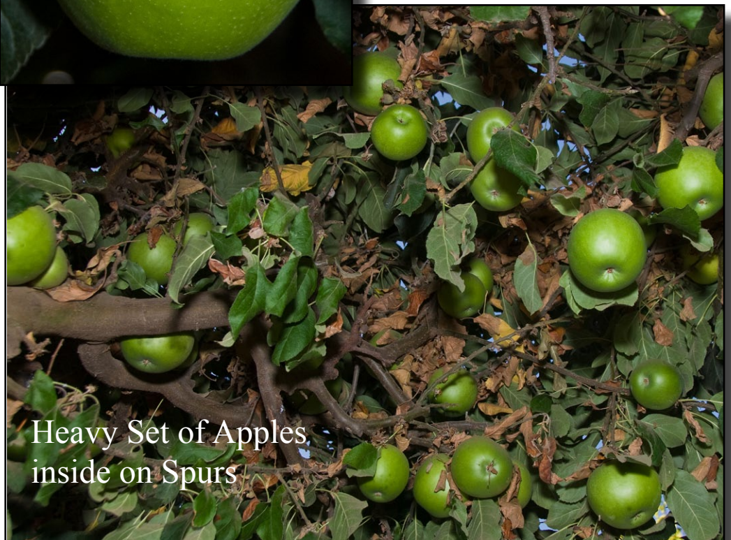
Heavy Set of Apples inside on Spurs